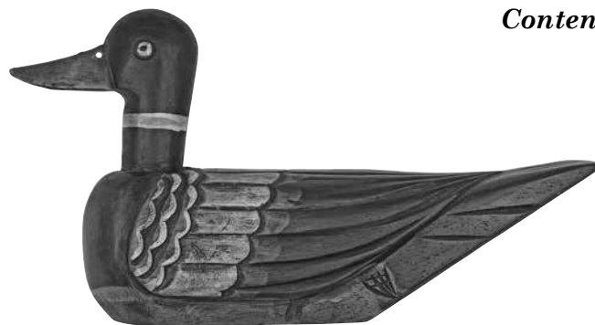
American carved duck decoy