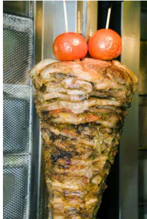
Meat cooking on skewer for authentic greek gyro sandwich.