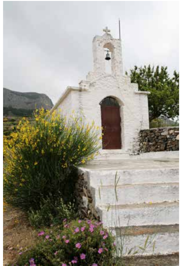
A small white Greek church. Photo taken on: May 19th, 2007. ID 8402529