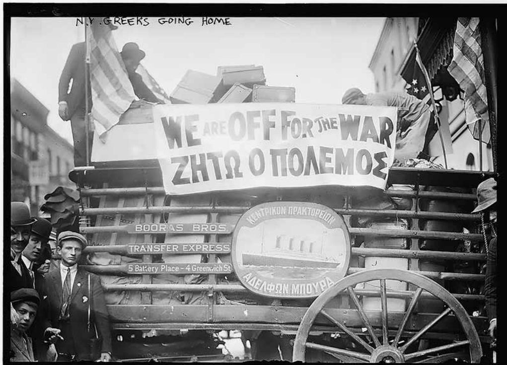
In N.Y., patriotic young Greek men going home in 1912.