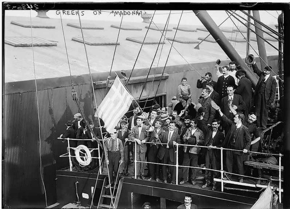
Greeks boarding MADONNA