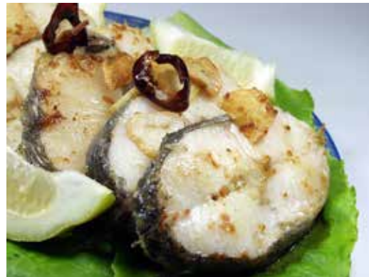
Slices of fried hake cooked with garlic and lemon. ID 1110579