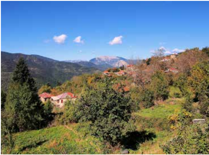
Remote Greek mountain village, Kerasia, mainland. Photo taken on: October 18th, 2014. ID 46010709 © Bruce Whittingham | Dreamstime.com