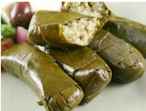
Dolmas - grape leaves stuffed with rice. ID 4776382 © Jabiru | Dreamstime.com