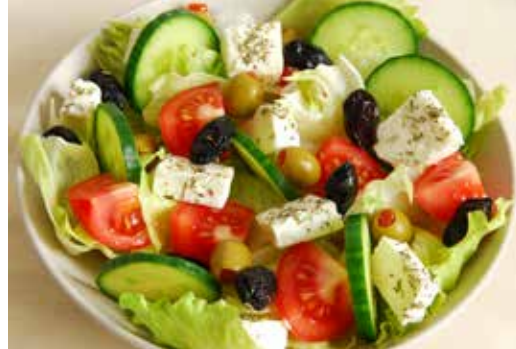
Fresh Greek salad with lettuce, feta cheese, tomato, cucumber, green and black olives, and anchovies. ID 7477508