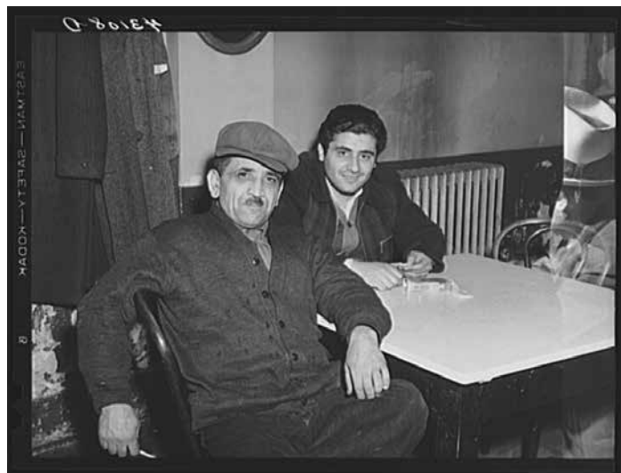
A Greek restaurant in Aliquippa, Pennsylvania, Greek steelworkers of the Jones and Laughlin Steel Corporation

http://mentalfloss.com/article/52281/brief-history-ice-cream-truck