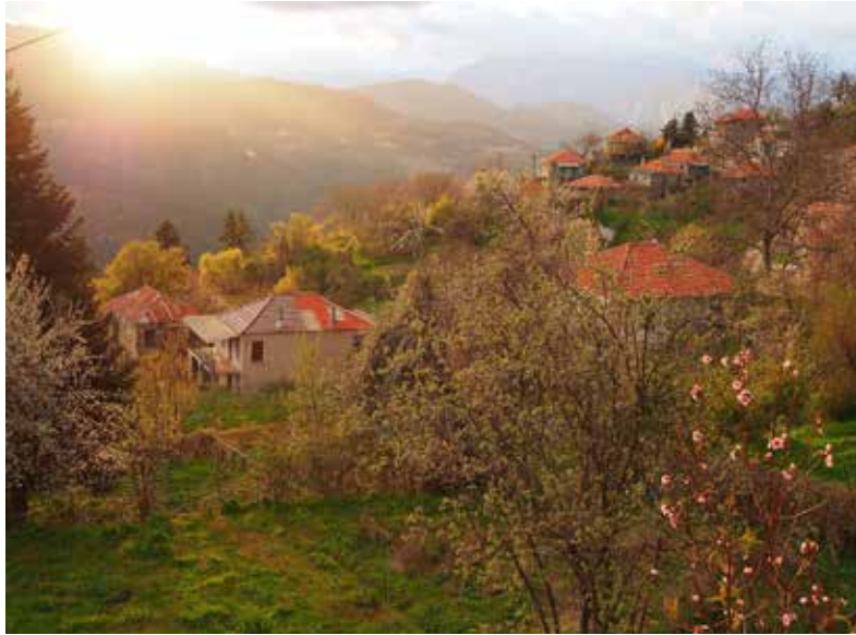
Greek mountain village, Kerasia, in golden light before Spring snow storm. Photo taken on: April 17th, 2014. ID 45986093