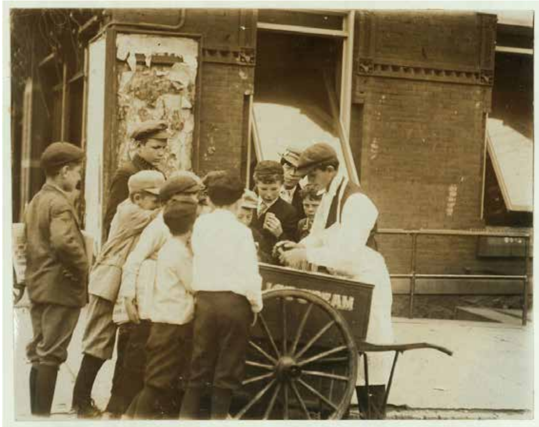
Selling ice cream on a street corner from a pushcart.