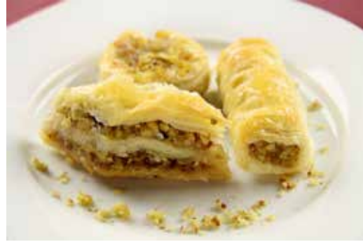
Deliciously sweet fresh baked baklava made with filo dough and chopped walnuts or pistachios. ID 13255033 © Jabiru | Dreamstime.com