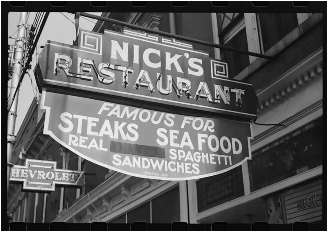
Nick's Greek restaurant in Paris, Kentucky