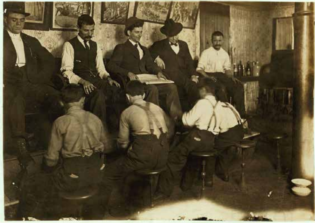
Greek Bootblacks in Indianapolis. (Same boys are in both photos.) Aug., 1908. Wit., E. N. Clopper. Location: Indianapolis, Indiana.

Top: http://www.loc.gov/pictures/resource/nclc.03209/