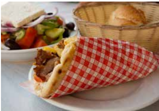
Greek gyros typically include tomato, onion, fried potatoes tzatziki in addition to the meat. ID 26997921 © Dbdella | Dreamstime.com