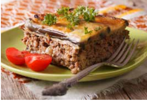
Moussaka made with beef, eggplant, onions, cheese, tomatos. and herbs and spices. ID 58942650 © Sergii Koval | Dreamstime.com