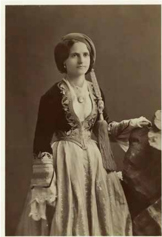
A young Greek-American immigrant on Ellis Island, New York late 19th-20th century