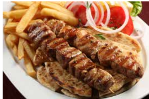
Souvlaki - meat roasted on a skewern with pita bread. ID 28536826 © Periklis Kontongonas | Dreamstime.com