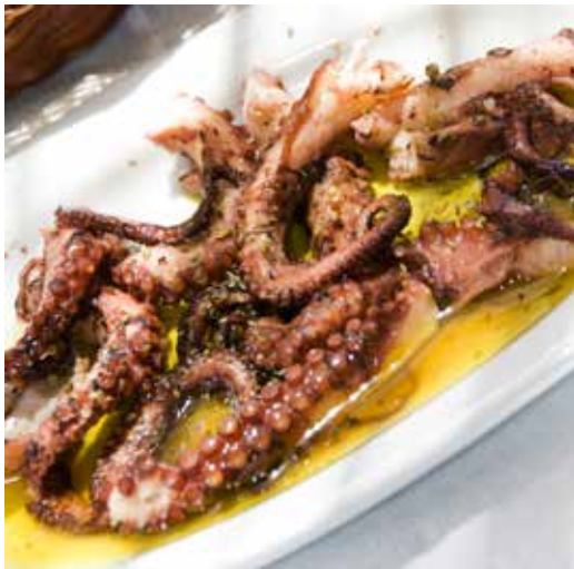
Marinated, grilled octopus.