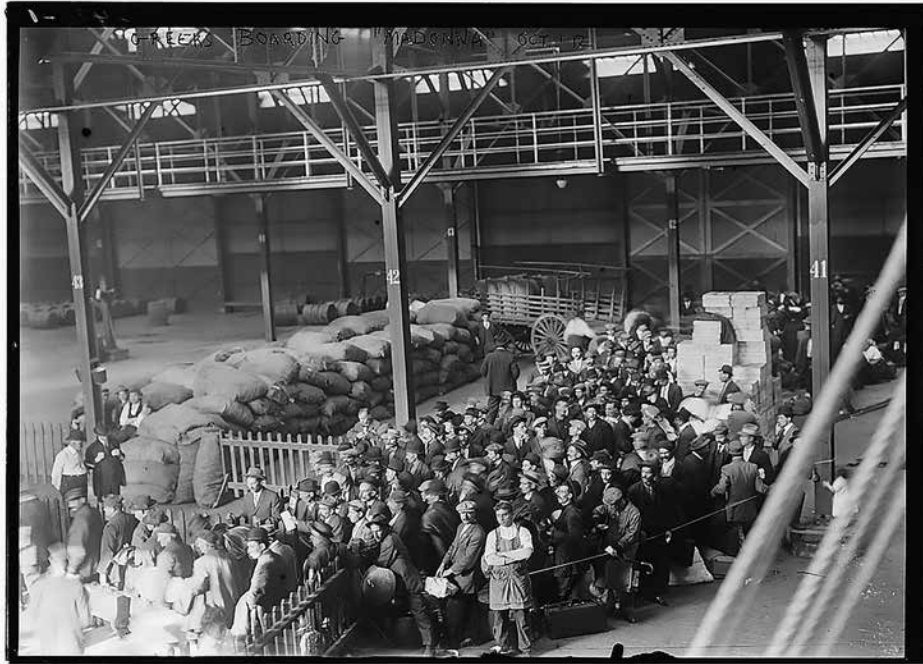
Leaving N.Y., going to war. Greeks boarding MADONNA, Oct. 1912 http://www.loc.gov/pictures/resource/ggbain.10726/